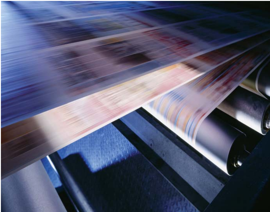
Material transport systems like this example in a printing works are just one of the many applications for the new FR-E700 series.