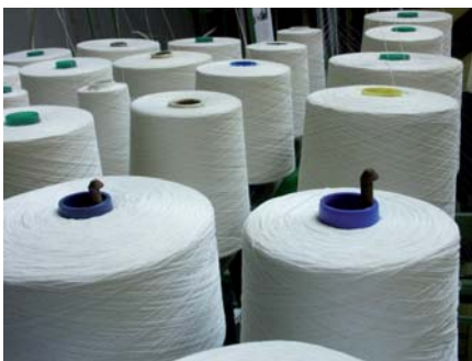
Mitsubishi frequency inverter drives are now standard equipment in the textile industry.