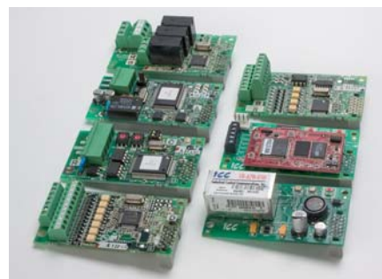
Option cards for additional functions

Functions can be added with option cards and additional I/O modules to configure the system for individual applications and requirements.