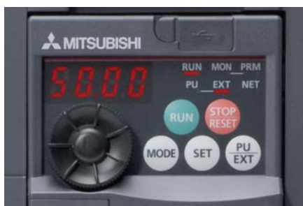
The installed Multi User Panel with the Digital Dial

In addition to entering and displaying parameter values, the integrated LED display is also used to monitor and check operating values and alarm codes.